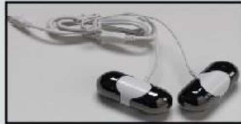
HAND Titanium plated