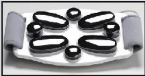
ABDOMEN Titanium plated