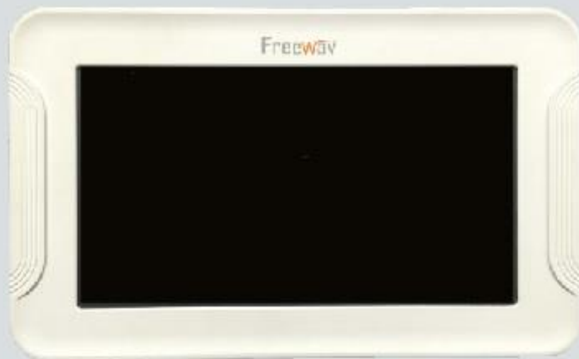
Main Unit 10.1 Inch Full Touch Screen 5800mA Li-Polymer rechargeable Battery