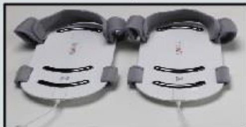
FEET Titanium plated