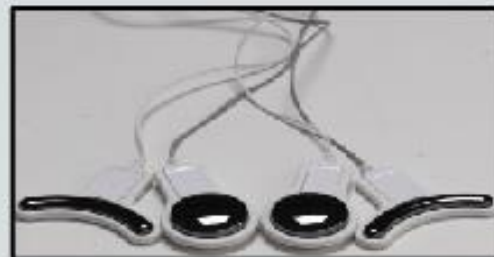
BREAST Titanium plated