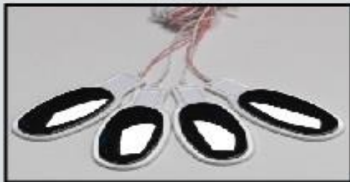
THIGH & wide area Titanium plated